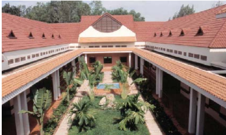
The PPHC inner garden.

Office: 855-1222-2778 Fax: 855-2372-3174