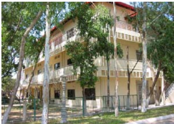
View from the garden at the Children's Pavilion.