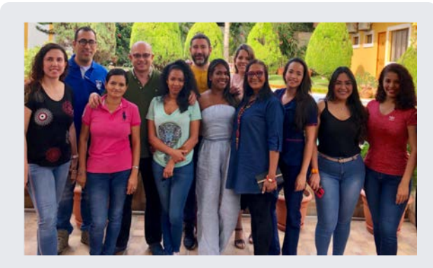
The team of Colombian SoH volunteers who traveled to Nicaragua - some returning for a fourth time!

Due to the country's economic downturn and an acute dengue epidemic, the Heart Center was unable to perform the same volume of procedures as in previous years (an average of 150 procedures were performed annually from 2015-2018, vs. 89 in 2019). In 2020, Surgeons of Hope will double down on its efforts to support the program and will provide intensive care unit training for the center's nurses, which is critical for patient recovery.