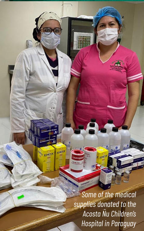
Some of the medical supplies donated to the Acosta Ñu Children's Hospital in Paraguay