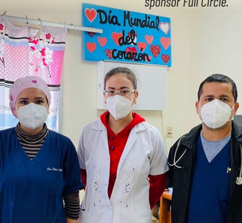
Critical medical supplies delivered to hospitals in Nicaragua and Paraguay included KN-95 masks donated by generous SOH corporate sponsor Full Circle.