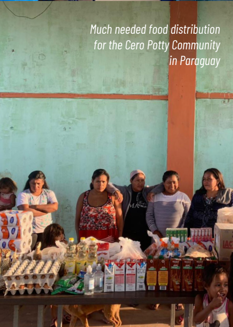
Much needed food distribution for the Cero Potty Community in Paraguay