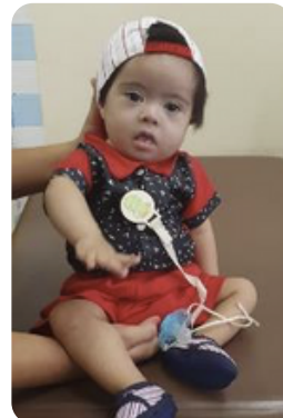
Lucca, 11 mos